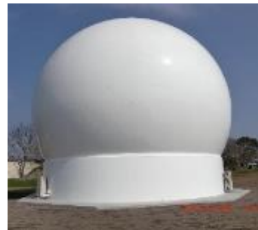
Figure 2 Radome of Yamagawa solar radio observatory

Routine observation of solar radio bursts started in August 2016 at Yamagawa radio observation facility, NICT. The observed frequency is in the range of 70 - 9000 MHz which is one of the widest frequency ranges in the world. Full resolution of time and frequency are 8 milliseconds, and 31.25 kHz (MHz range) and 1 MHz (GHz range), respectively. Right and left handed circular polarizations are obtained. Low resolution data (1 second and 1 MHz) will be distributed in FITS format in 2017.